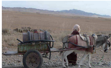
Farmers carrying water in Qinghai

This year's Service Project Committee is supported by 12 members and is much larger than previous years; it has presented a -Rmb680,000 budget to the Board's approval for a wide range of service projects covering both the Shanghai vicinity and rural areas in China.