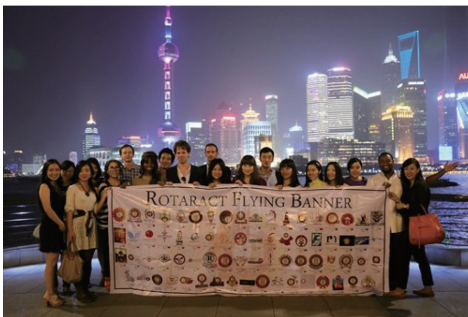
Members of the Rotaract Club of Shanghai pose for a group photo at the Bund.